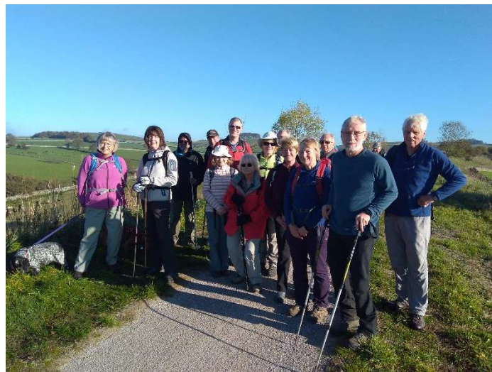
High Altitude Training camp

Another pleasant stroll bought us with lovely views to back our hotel and back home.