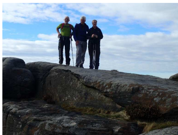
On Froggatt Edge