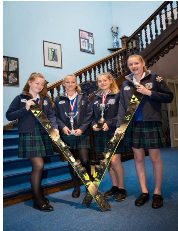
Kingsley School under 16 Age Groups team