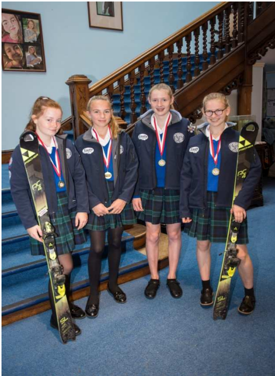
Kingsley School Open Age Groups team

The skiers from Solihull School also performed very well and qualified for the British championships at Hillend