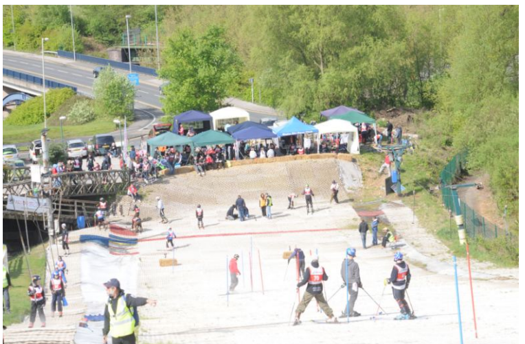
Midland Club National: Course Inspection

At many races, we also video most runs of the MSC participants, and these videos are available on YouTube for you to see how you did. There is an index to the videos at www.midlandski.org.uk/videos .